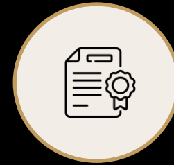
CERTIFICATE OF AUTHENTICITY